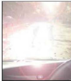
Without Carl Zeiss Vision Polarized Lenses